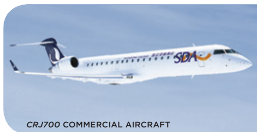
CRJ700 COMMERCIAL AIRCRAFT

In aerospace, we account for one third of the business jet fleet in China with over 100 aircraft. Six airlines operate 47 Bombardier commercial aircraft in Greater China.