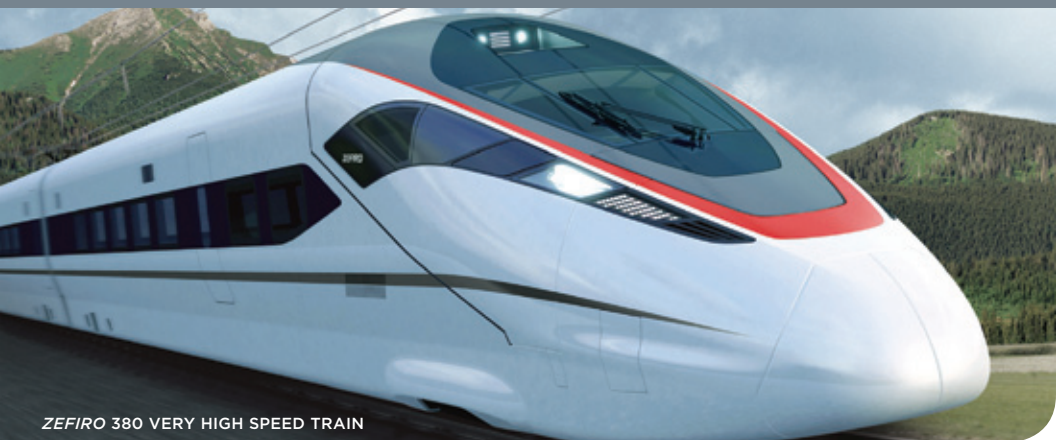
ZEFIRO 380 VERY HIGH SPEED TRAIN

Our Transportation group has long played a key role in developing China's urban mass transit and advanced rail networks. Today we are actively transferring our industry-leading technology and proven management expertise through our joint ventures and wholly foreign owned enterprises. We work with our Chinese partners to provide the country's major cities with state-of-the-art rail solutions and services, from metro cars to very high speed trains.