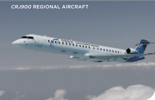
CRJ900 REGIONAL AIRCRAFT