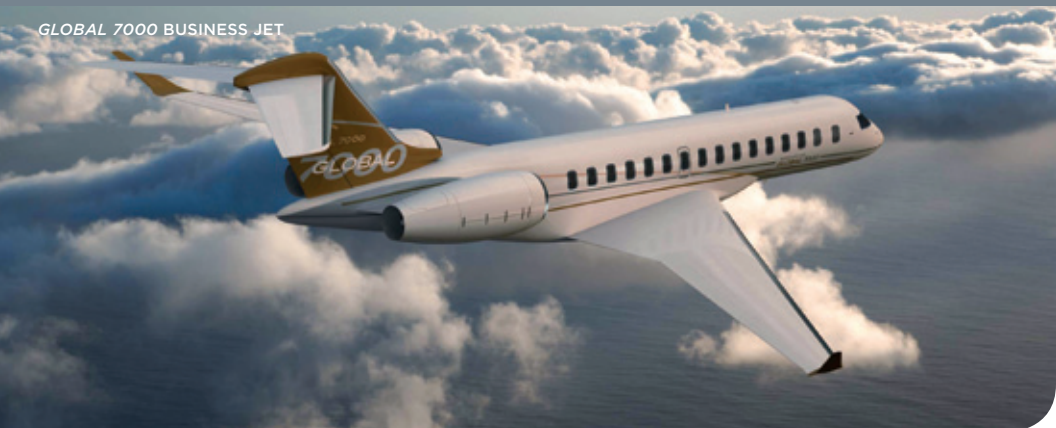
GLOBAL 7000 BUSINESS JET

Our relationship with China began more than 50 years ago. Today this partnership continues to grow stronger through ongoing investments in people, manufacturing facilities and advanced technology.