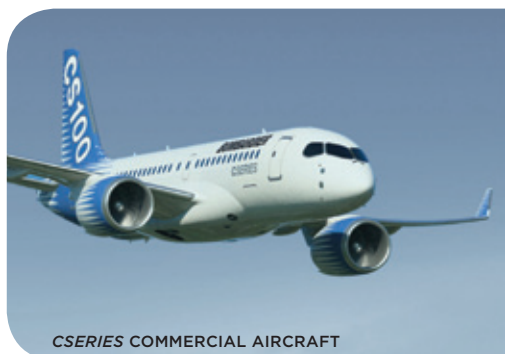
CSERIES COMMERCIAL AIRCRAFT