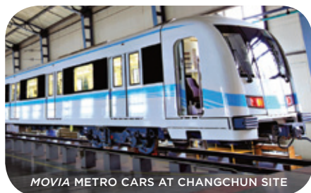
MOVIA METRO CARS AT CHANGCHUN SITE

Bombardier Transportation and BCP respectively signed contracts with Nanjing CSR Puzhen Rail Transport Co., Ltd. to jointly provide 18 modern trams with 100% low floor for Suzhou, and 15 catenary-free modern trams with 100% low floor for Nanjing. Shentong Bombardier (Shanghai) Rail Transit Vehicle Maintenance Company Ltd. won two contracts for vehicle overhaul for 498 cars of Shanghai Metro Line 7 & 9. Also in 2013, Bombardier Transportation and BCP won bids to supply propulsion systems for up to a total of 1,000 metro cars in Changchun, Shenzhen, Foshan and Hefei.