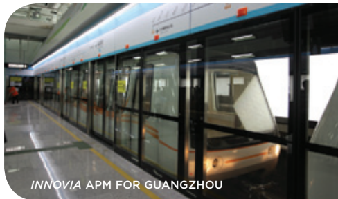
INNOVIA APM FOR GUANGZHOU