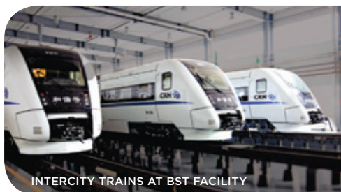
INTERCITY TRAINS AT BST FACILITY