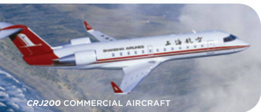
CRJ200 COMMERCIAL AIRCRAFT